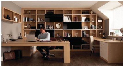
OFFICE STORAGE & ORGANIZATION