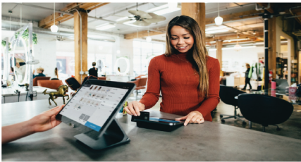
POINT OF PURCHASE

AMT Plastics provides products and services across a wide range of industries, including material handling, storage solutions, telecommunications, electrical, and consumer products. Their expertise allows them to create customized solutions that cater to the specific needs of each industry, helping clients improve efficiency, organization, and overall performance.