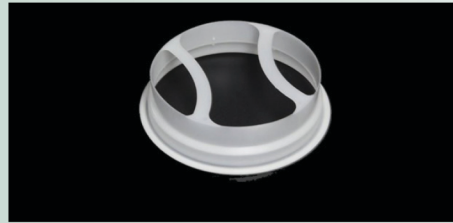
FLANGES AMT 7" Part #: 60-62035