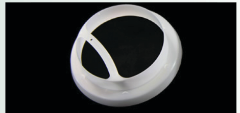
FLANGES P40SS 4" Part #: 60-62044