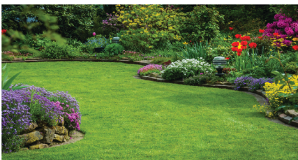
LAWN & GARDEN