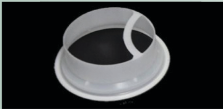
FLANGES AMT 4" Part #: 60-62034