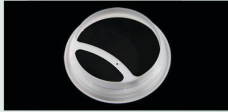
FSI POLYLOCK 4" Part #: 60-62064