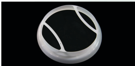
FLANGES P20SS 7" Part #: 60-62045