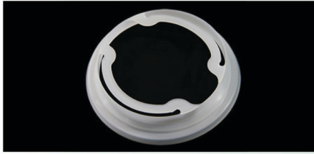
FLANGE 6" Part #: 60-1021-06