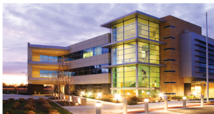
COMMERCIAL & RESIDENTIAL LIGHTING